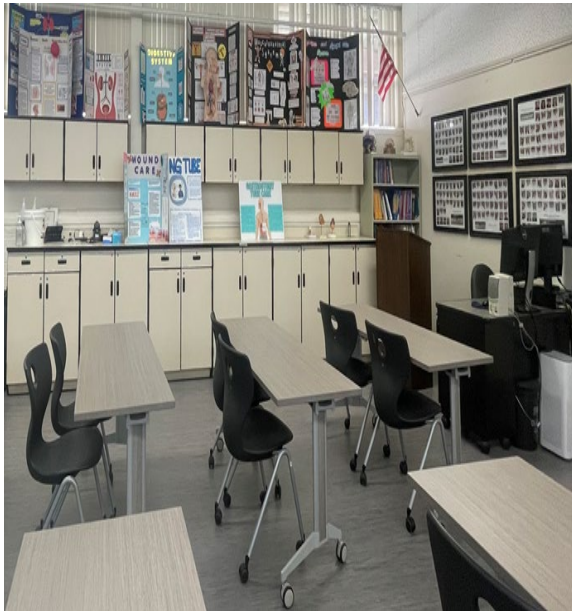
Classroom with desks, chairs, and cabinets