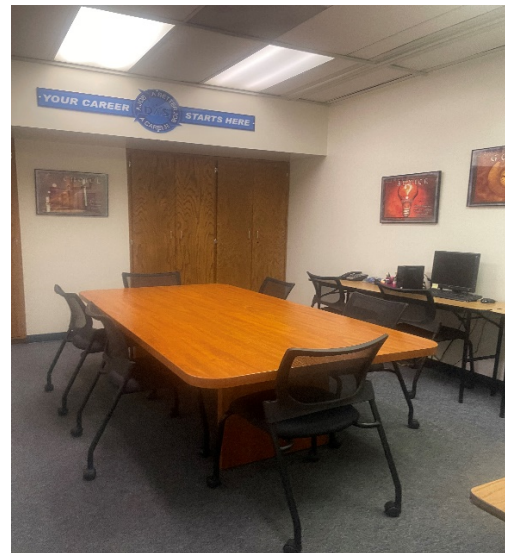
Conference room with long table and six chairs