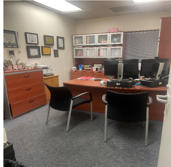
Program Director's office with a desk and chair