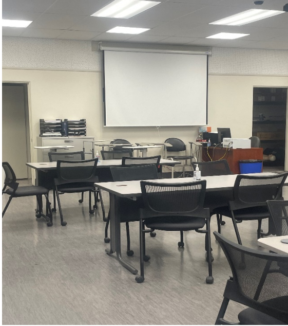
Classroom with desks, chairs, and projection screen on wall