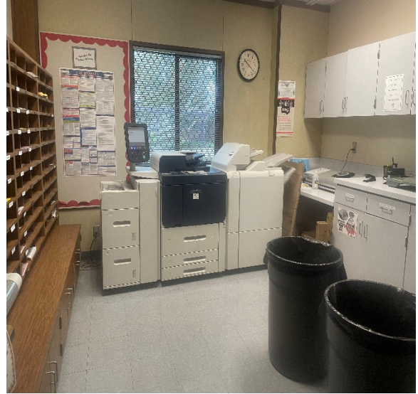
Faculty workroom with printer, cabinets, and shelves