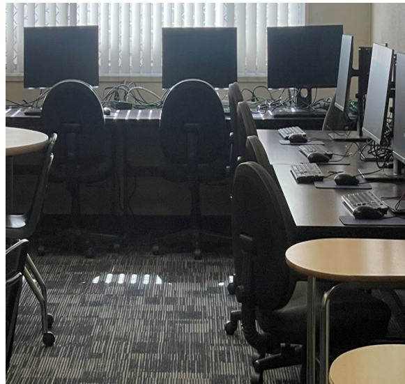
Resource Center with five computer monitors on desks with chairs