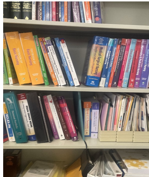
Bookshelf with reference books