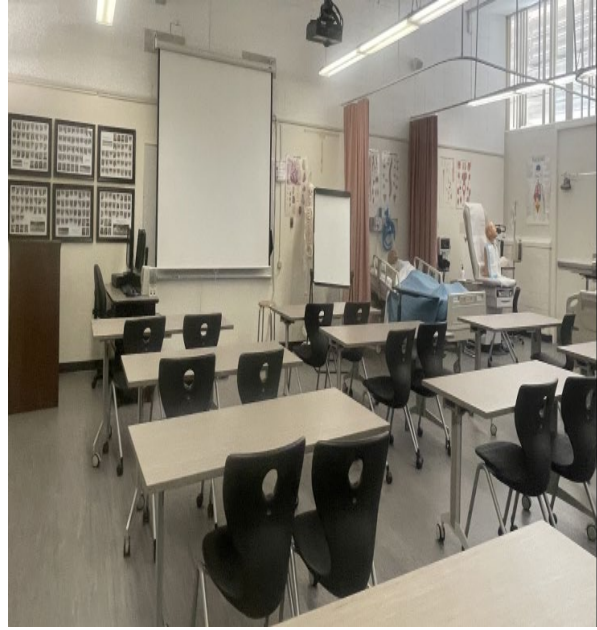
Classroom with desks, chairs, podium, and projection screen on wall