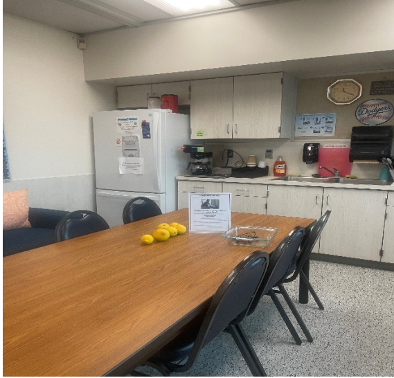
Faculty lounge with long table five chairs, cabinets, and refrigerator