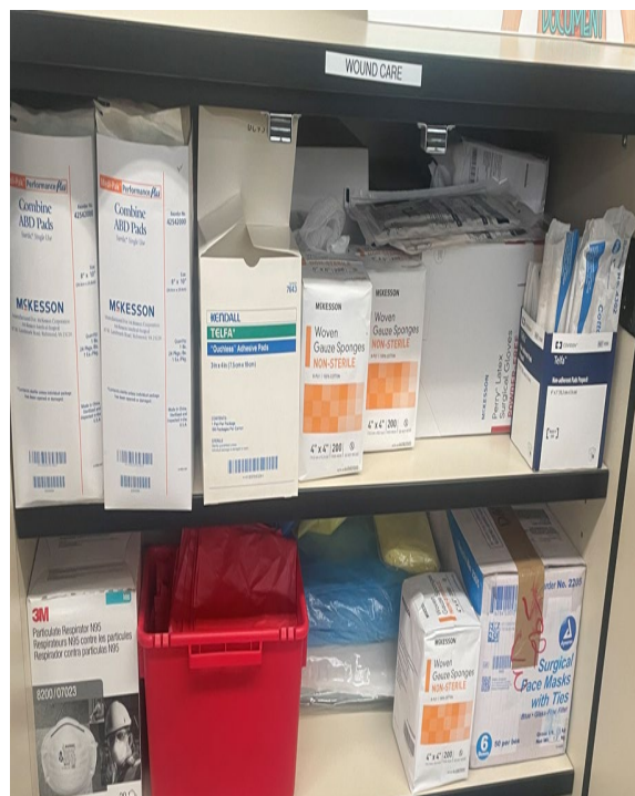
Patient care supplies