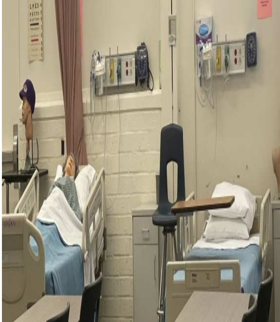
Skills lab with two patient beds, mannequin in one bed