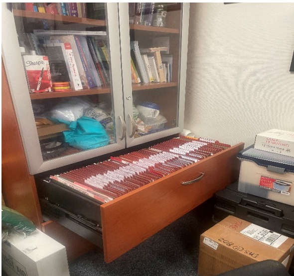
Cabinet with student files pulled out