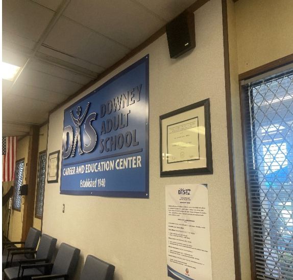
Downey Adult School sign and pictures on the wall