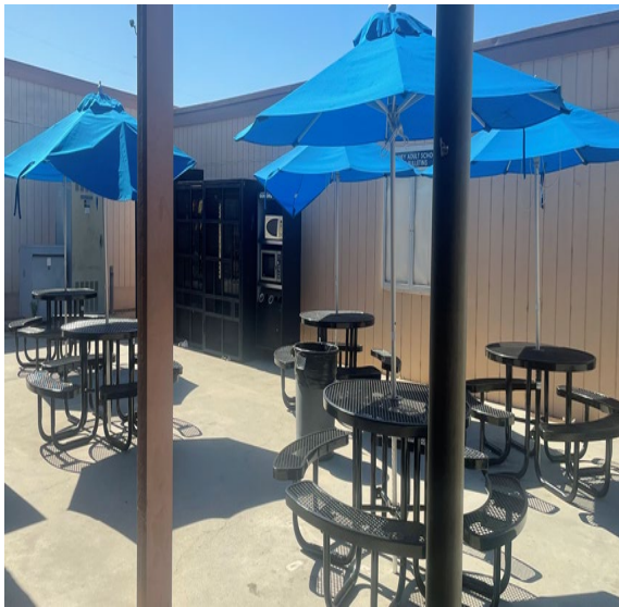
Umbrellas over outside tables and chairs