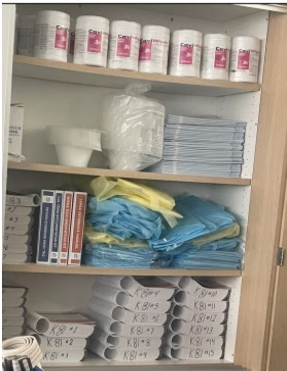
Patient care supplies and books